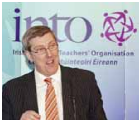
Education Minister, John O'Dowd