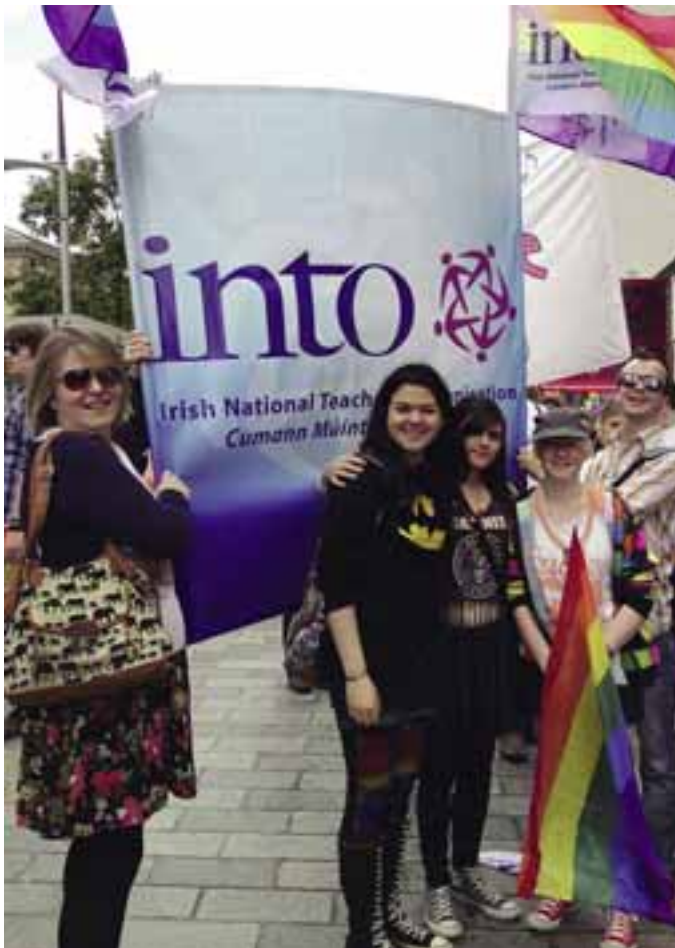
Belfast Pride 2012