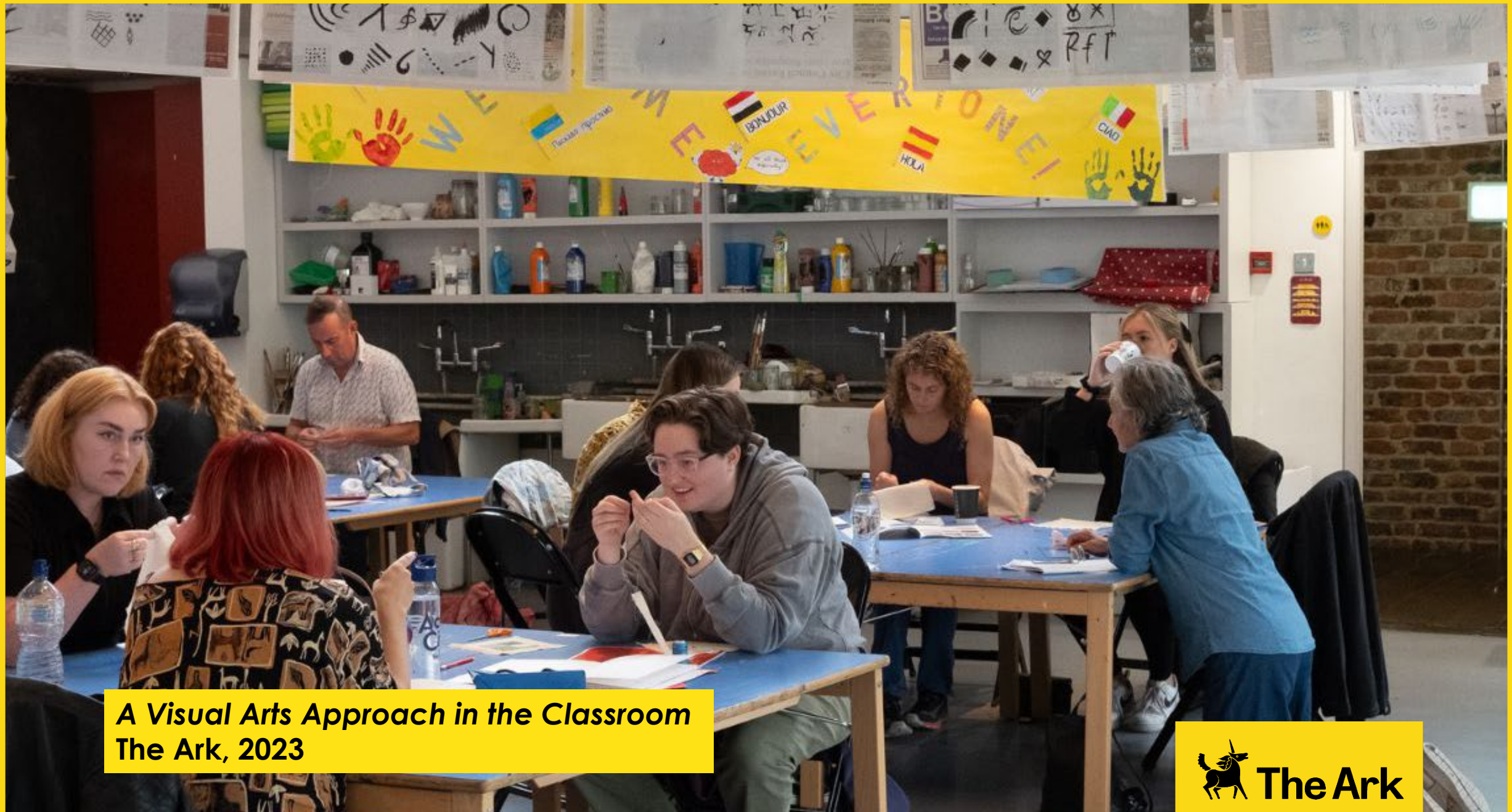
A Visual Arts Approach in the Classroom The Ark, 2023