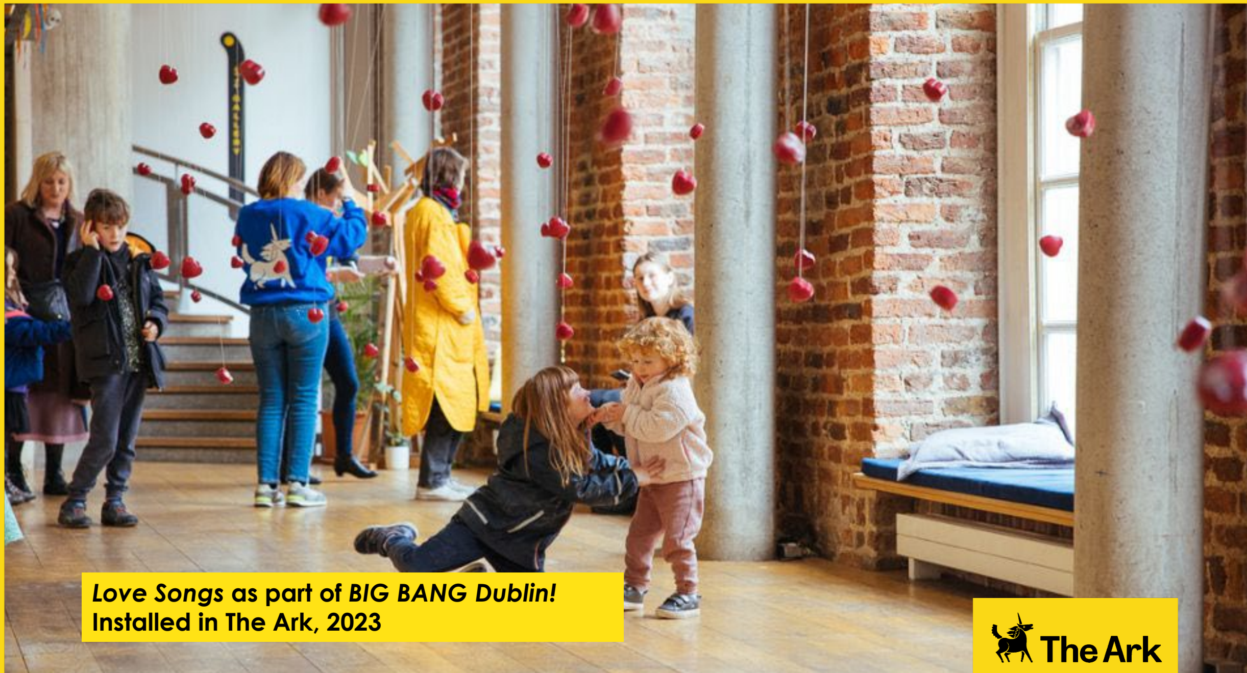
Love Songs as part of BIG BANG Dublin! Installed in The Ark, 2023