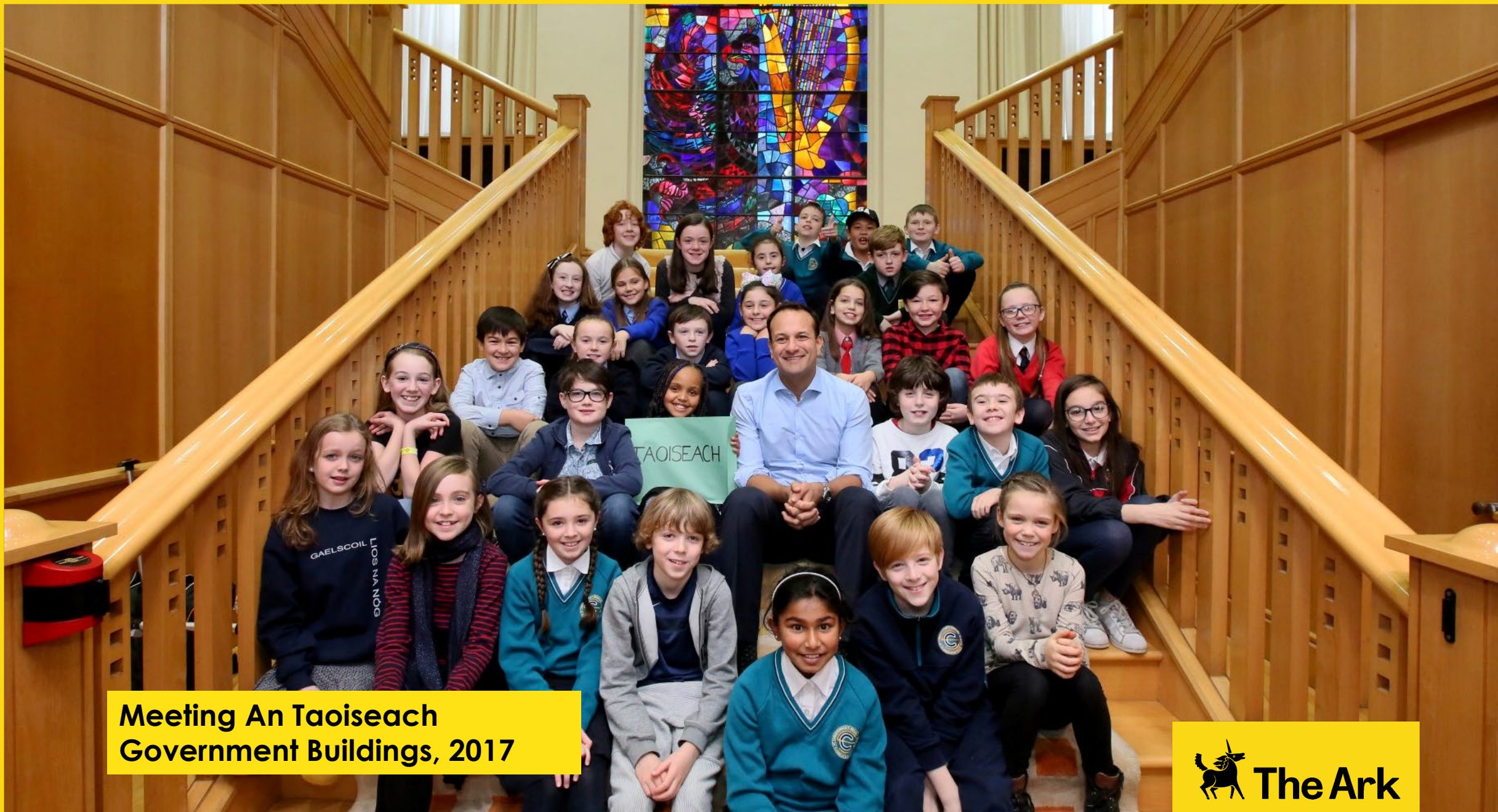
Meeting An Taoiseach Government Buildings, 2017