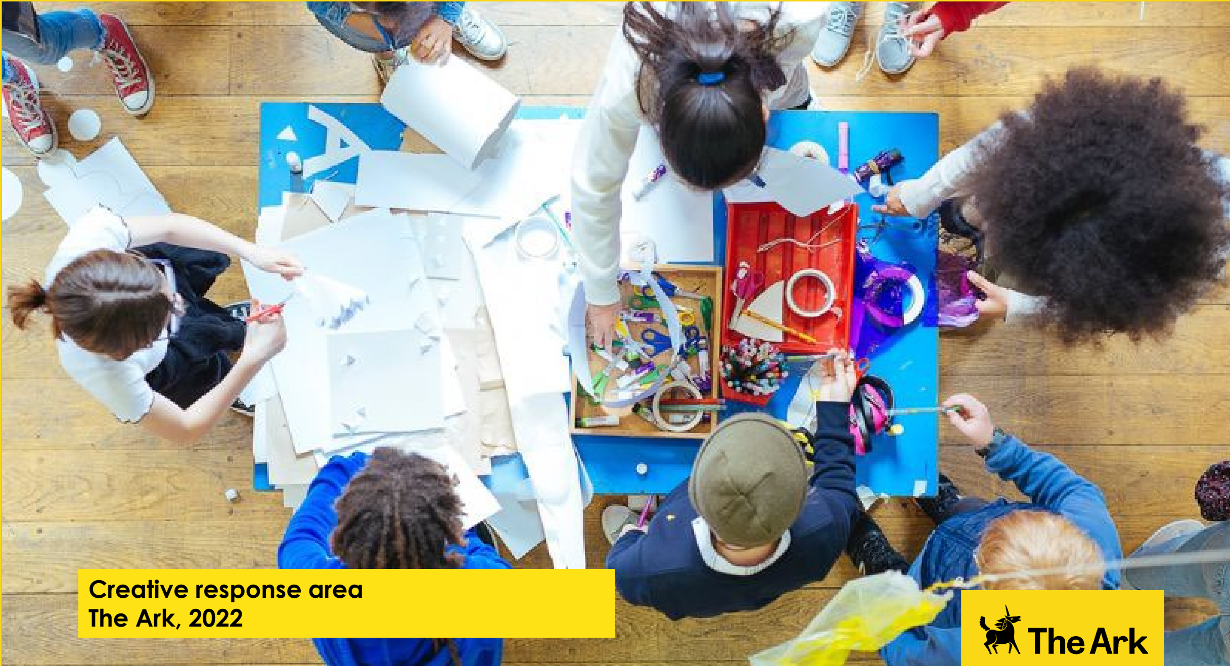
Creative response area The Ark, 2022