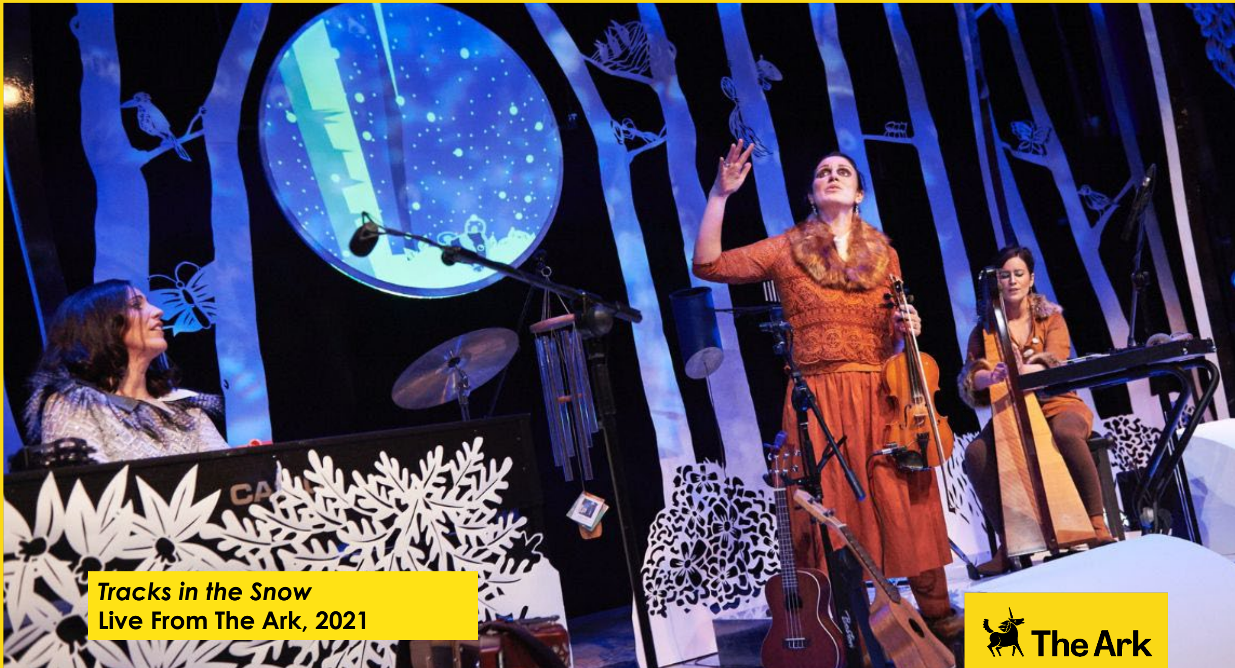
Tracks in the Snow Live From The Ark, 2021