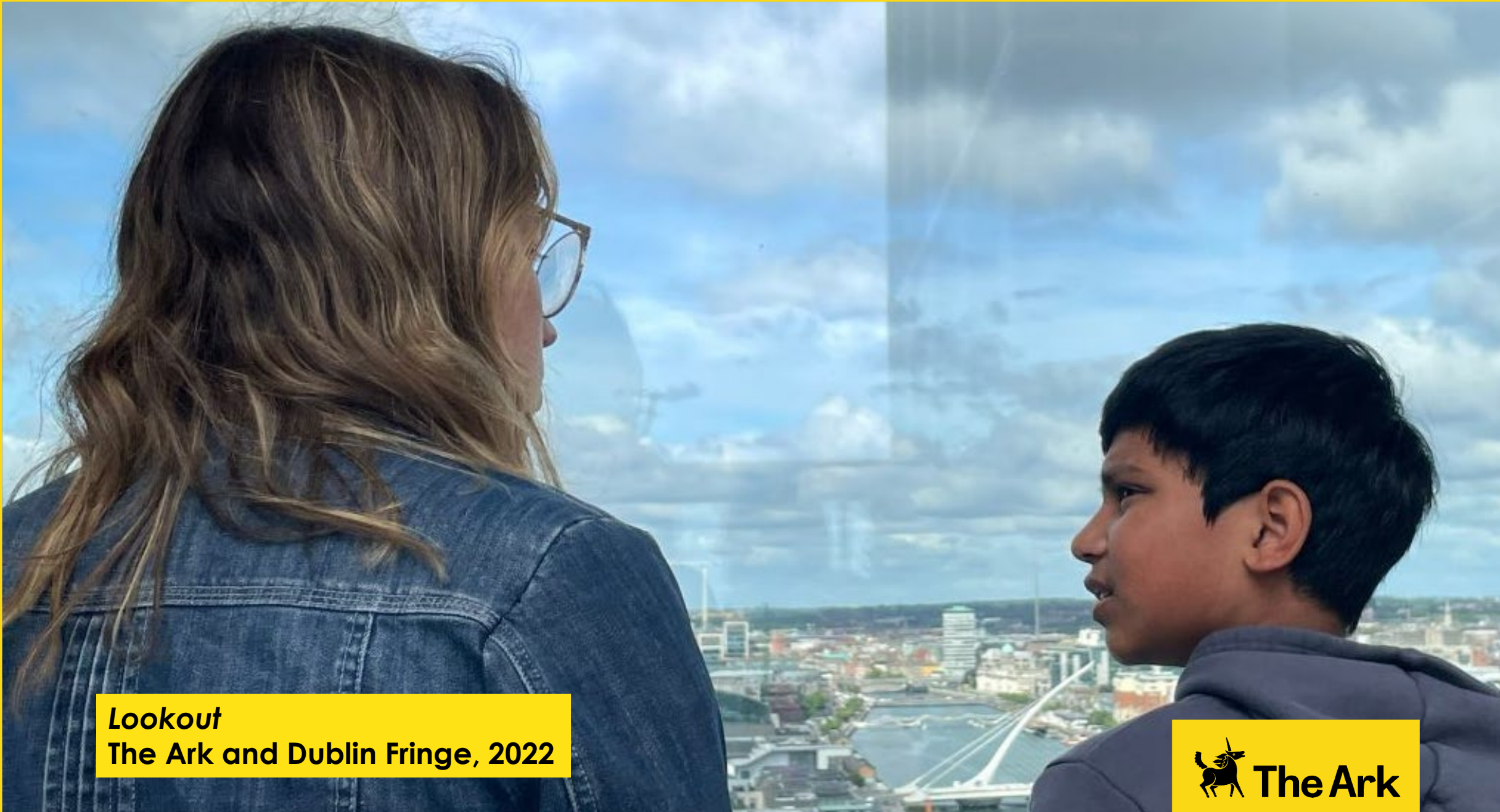
Lookout The Ark and Dublin Fringe, 2022