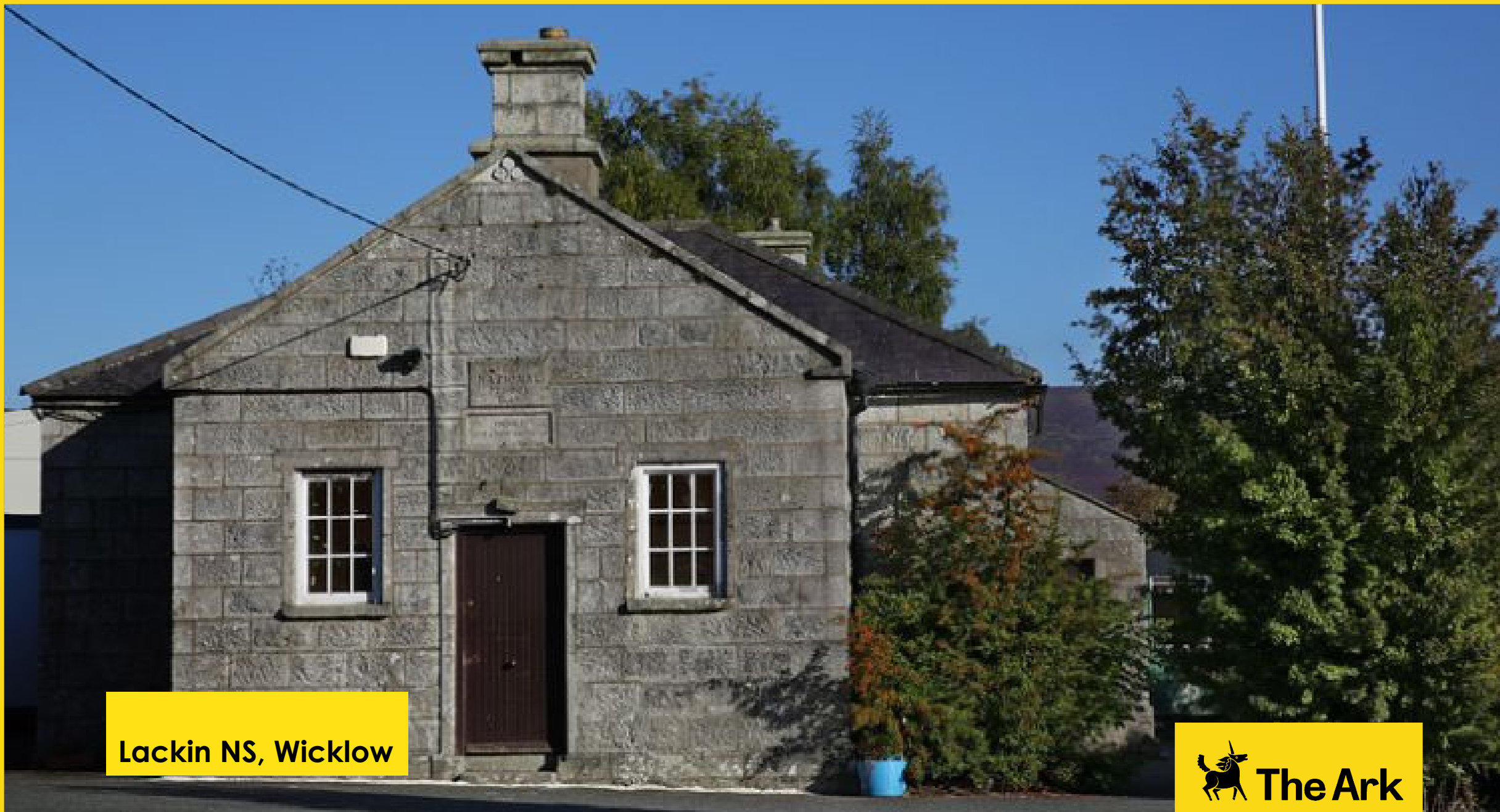
Lackin NS, Wicklow