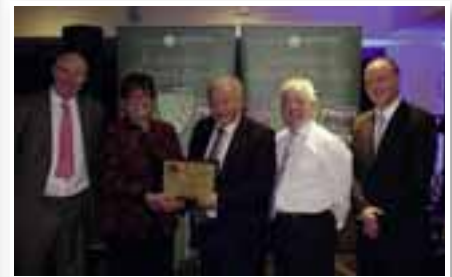
Above: Annagary East, Letterkenny, Co.Donegal